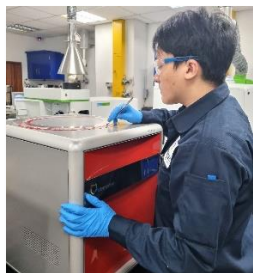
CHN CONTENT ANALYSER