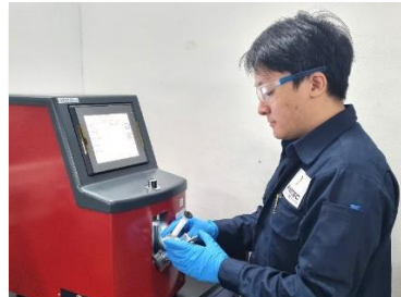
FAME CONTENT ANALYSER