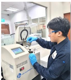
ENERGY CONTENT ANALYSER

In keeping with our commitment to providing world-class services, we conduct BioFuel analysis for routine and enhanced testing using the latest technology and equipment, as seen below: